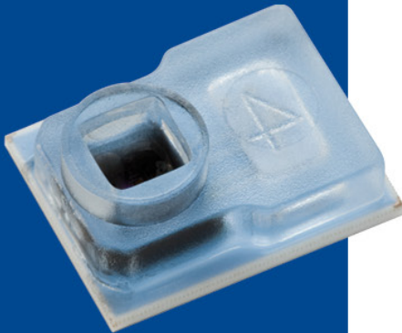
BP Series Blood Pressure Sensor